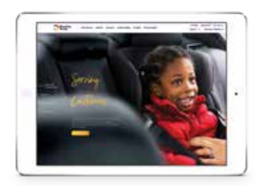
For more information please visit https://www.directlinegroup.co.uk/en/investors.html

Registered in England & Wales No. 02280426 Registered Office: Churchill Court, Westmoreland Road, Bromley, BR1 1DP